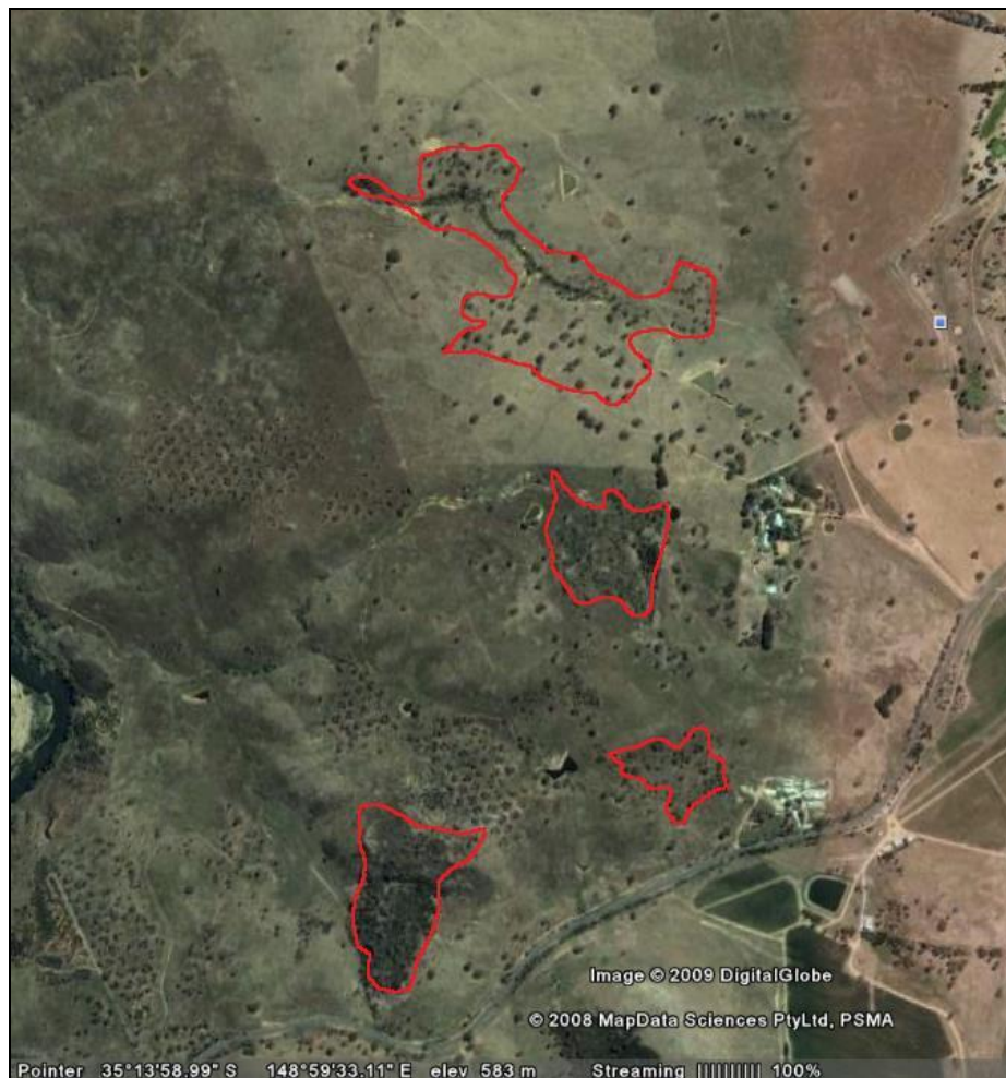
Figure 2. Woodland Areas in the Study Area.